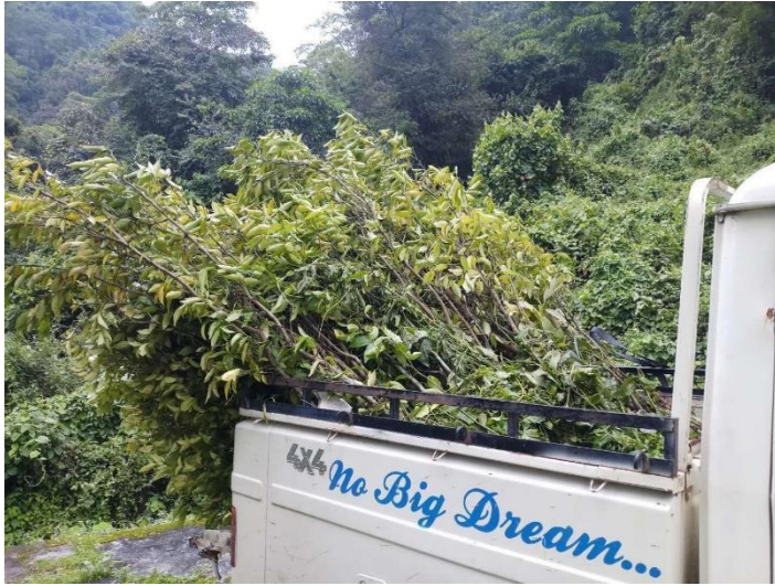
Image 4: Illegal consignment of citrus seedlings intercepted at AIE Checkpoint, Gelephu