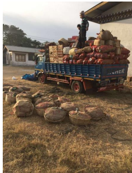
Image 1 and 2: Illegal import of plant products intercepted at Phuentsholing Entry Point