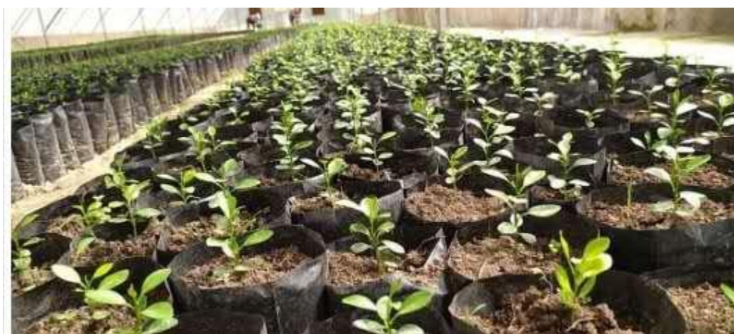
Image 1, 2 and 3: Citrus Nursery Farm at NSC, Trashiyangtse registered with BAFRA