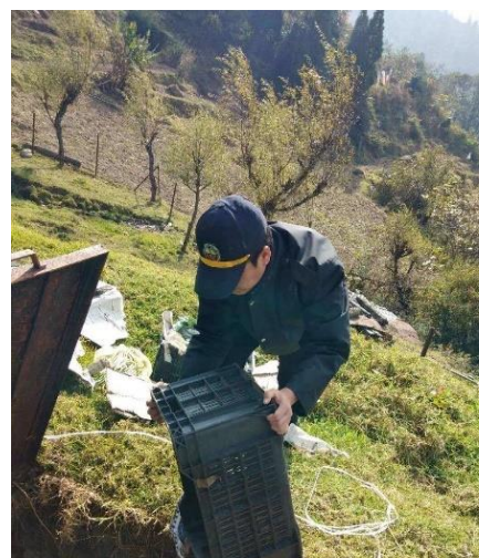
Image 3 and 4: Disposal of illegally imported plant products at PAQS, Phuentsholing