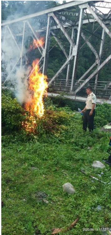
Image 6 and 7: Destruction of citrus seedlings at AIE Checkpoint, Gelephu