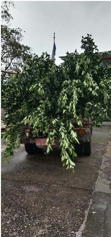
Image 5: Illegal consignment of citrus seedlings intercepted at Raidak Checkpoint, Lhamoizingkha